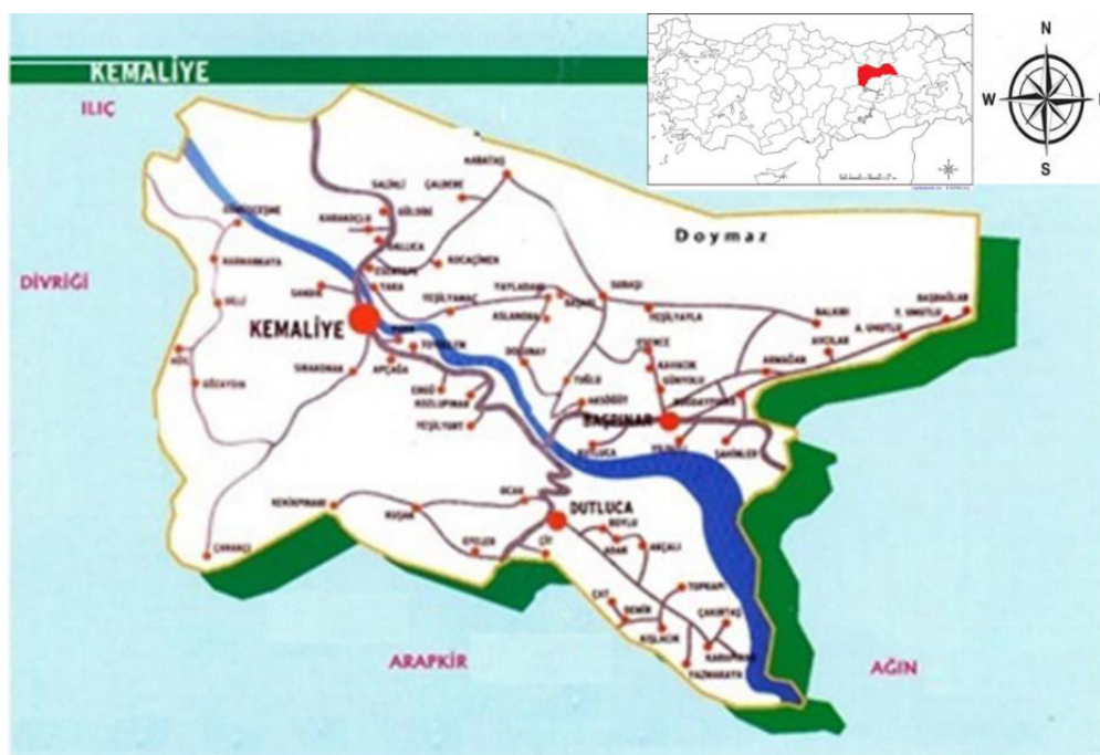
Figure 1. Map of the Kemaliye.

The materials of the study consisting of 1800 vascular plant specimens were collected between