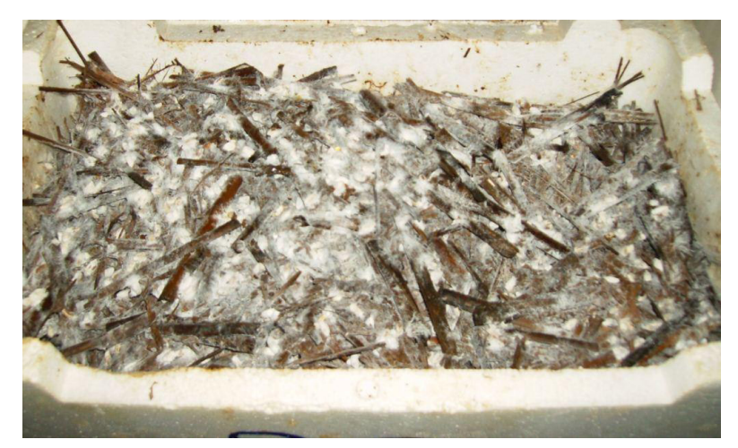
Figure 1. Mycelial growth completion of A. bisporus X25 on reed straw compost in the box.

wheat ( Triticum sativum ) straw, reed ( Phragmites australis ) straw and their mixture 1:1 [26].