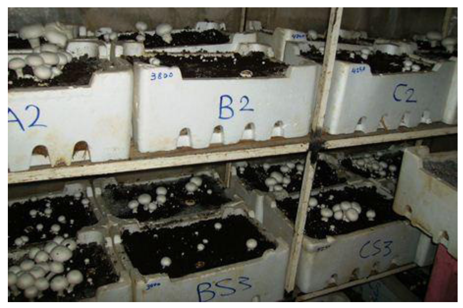
Figure 2. Fruiting bodies of Agaricus bisporus X25 in mushroom room. Legend : A2: wheat straw compost, B2: reed straw compost, C2: the mixture compost (1:1), AS3: wheat straw compost which decomposed using bacterial inoculum Streptomyces , BS3: reed straw compost which decomposed using Streptomyces . CS3: mixture compost which decomposed using Streptomyces .

g/box significantly (P < 0.05), followed 400.67, 397.50 and 396.17 g/box for the mixture compost with and without treatment and wheat straw compost with treatment respectively. While the lower productivity was 344.83 g/box for wheat straw compost (control) in this trial (Table 2 and Figure 2).