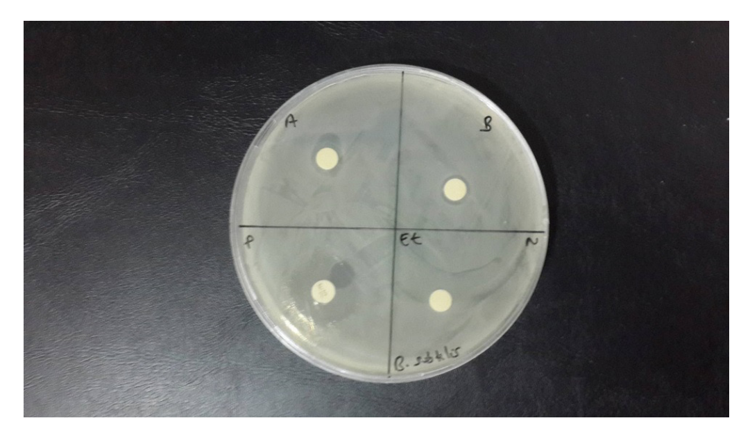
Figure 2. Evaluation of antimicrobial effect of ethanol extracts of Trametes versicolor on Bacillus subtilis by disc diffusion method.

to inhibit the growth of some disease causing bacteria and yeast. It can therefore be suggested that, some of extracts are promising antimicrobial agents.