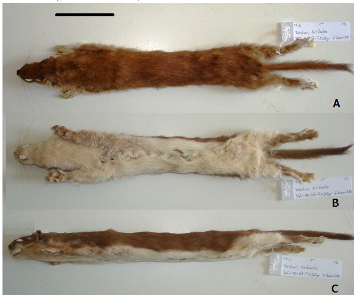
Figure 1. Dorsal (A), ventral (B), and lateral (C) views of the skin of a male Mustela nivalis specimen from Kırıkkale. The bar indicates 50 mm.

Measurements: External and cranial measurements and weights of adult specimens was presented in Table 1.